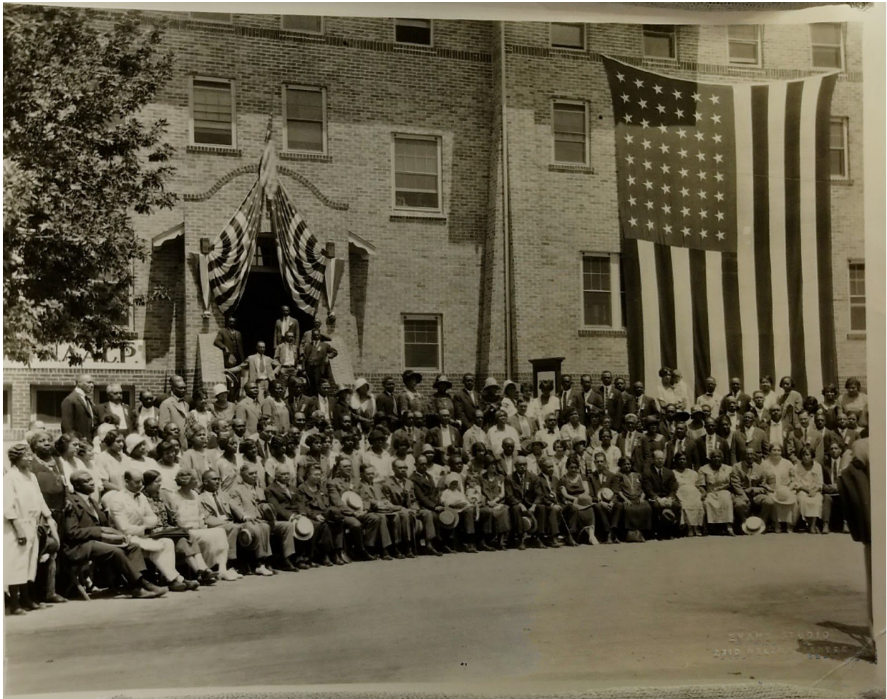
A group photograph of the NAACP outside the Glenarm Branch of the YMCA following one of their meetings.