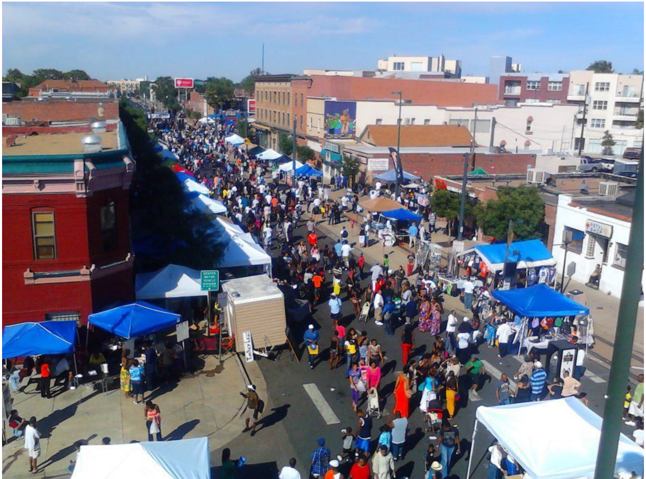
Vendors selling merchandise on Welton Street during the 2016 Juneteenth Festival.

Symone Roque, "The Juneteenth Music Festival Celebrates Culture through Music," 303 Magazine, last modified June 1, 2017, accessed February 24, 2019, https://303magazine.com/2017/06/juneteenth/ .