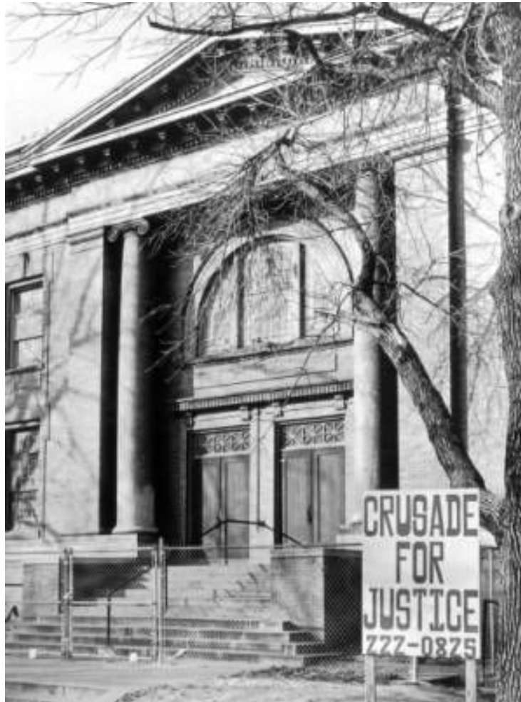
The front entrance to the Crusade for Justice building located on 1567 Downing Street.

Crusade for Justice Building , 1975, photograph, accessed April 13, 2019, http://digital.denverlibrary.org/cdm/ref/collection/p15330coll22/id/29869 .