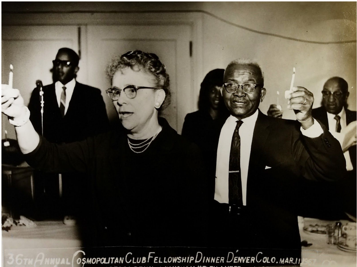
A commemoration held at the 36th Annual Cosmopolitan Club Fellowship Dinner.