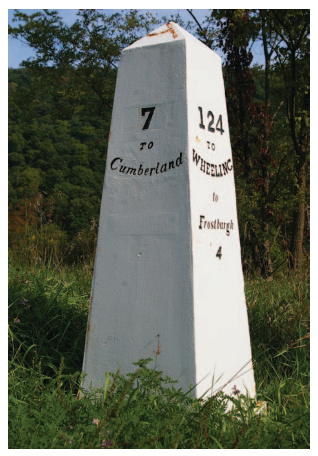
Figure 1. Originally constructed in the early nineteenth century as part of the National Road, from Cumberland, Maryland to Wheeling, Virginia, this milestone marks the distance to both ends of the nation's first highway, as well as to nearby Frostburg, Maryland. Working as a National History Day judge, the author was impressed by a student's project on a western Maryland milestone, which illustrated the value of studying U.S. history through a local or regional lens, as well as the benefits of visiting local archives and museums to enhance research possibilities.

history in Allegany County. This student's efforts in diligently researching an institution critical to the economic development of her community and her state earned a special prize for a project on Maryland