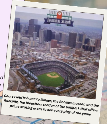
Coors Field is home to Dinger, the Rockies mascot, and the Rockpile, the bleachers section of the ballpark that offers prime seating areas to see every play of the game