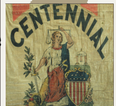
Known as the Centennial State, President Ulysses S. Grant formally granted Colorado statehood after years of political debate between rival parties, including the Republican Party, Democratic Party, and the Sand Creek Vindication Party.