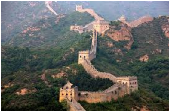
The Great Wall in Beijing, China