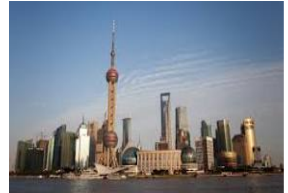
Oriental Pearl Tower in Shanghai