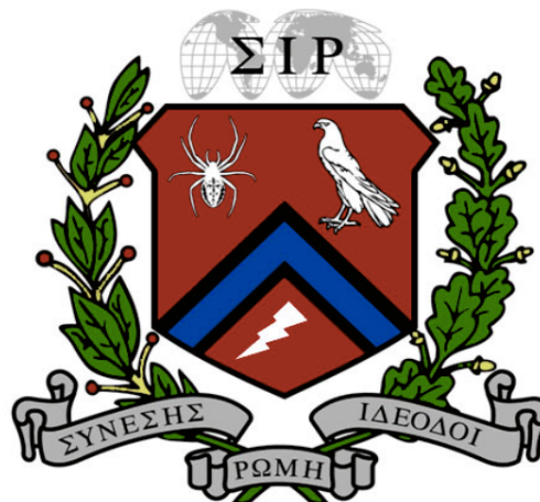
Sigma Iota Rho crest

Many certificates offered at CU Denver boost your resume by adding practical skills and specific credentials to your major.