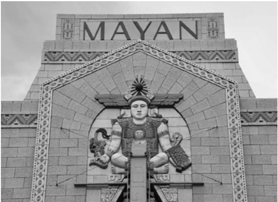
The front of the Mayan Theater features Itzamná ("Iguana House"). Known as the creator deity, he gave humankind writing and calendrics. The sculptors creatively divided, then integrated his features. Credit: Capitol Hill United Neighbors History Matters. CapitolHillUnitedNeighbors. https://www.chundenver.org/history-matters.html .

Art Deco features bold design using vibrant color schemes and sleek geometric patterns. It grew out of a yearning to be rid of the past, particularly of the excessive ornamentation of the Art Nouveau style of the nineteenth century. Whereas Art Nouveau was passé by World War I, Art Deco embraced the future in all its man-made, machine-driven glory. Commercial buildings of the 1920s through the 1940s borrowed stylistic elements from both Art Deco and Art Moderne. By the 1920s, Deco and Moderne became the styles of smart New