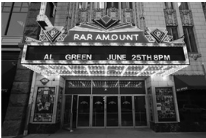
The Paramount Theater is Downtown Denver's Last Grand Art Deco Movie Palace. A designated historic landmark and impressive building; it is the only local theater of its time to maintain its original façade.