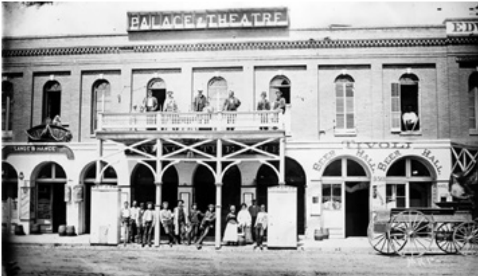
Located in Denver at 15th and Blake Streets, The Palace Theatre was one of the venues where Gus Mills, J. Arthur Doty, and other female impersonators performed.

The earliest theatrical performances in Denver typically included variety theater (mainly in saloons), minstrel shows, and burlesque, the content of which often overlapped with one another. 28 During Denver's frontier days (roughly the period between 1858 and 1870), most forms of theatrical entertainment blurred together, with variety shows displaying elements of burlesque, operettas featuring quirky side acts that eventually evolved into vaudeville, and minstrelsy largely reflecting variety shows, but with elements of blackface and racial commentary. 29 It is no wonder that William Byers, editor of the Rocky Mountain News , saw respectable theater as a civilizing influence on the miners and laborers of the city, as he always gave traveling theatre troupes ample approbation within the pages of his newspaper. 30 Byers' logic was clear and simple: if Denver could attract and cultivate respectable entertainment, its citizens would achieve