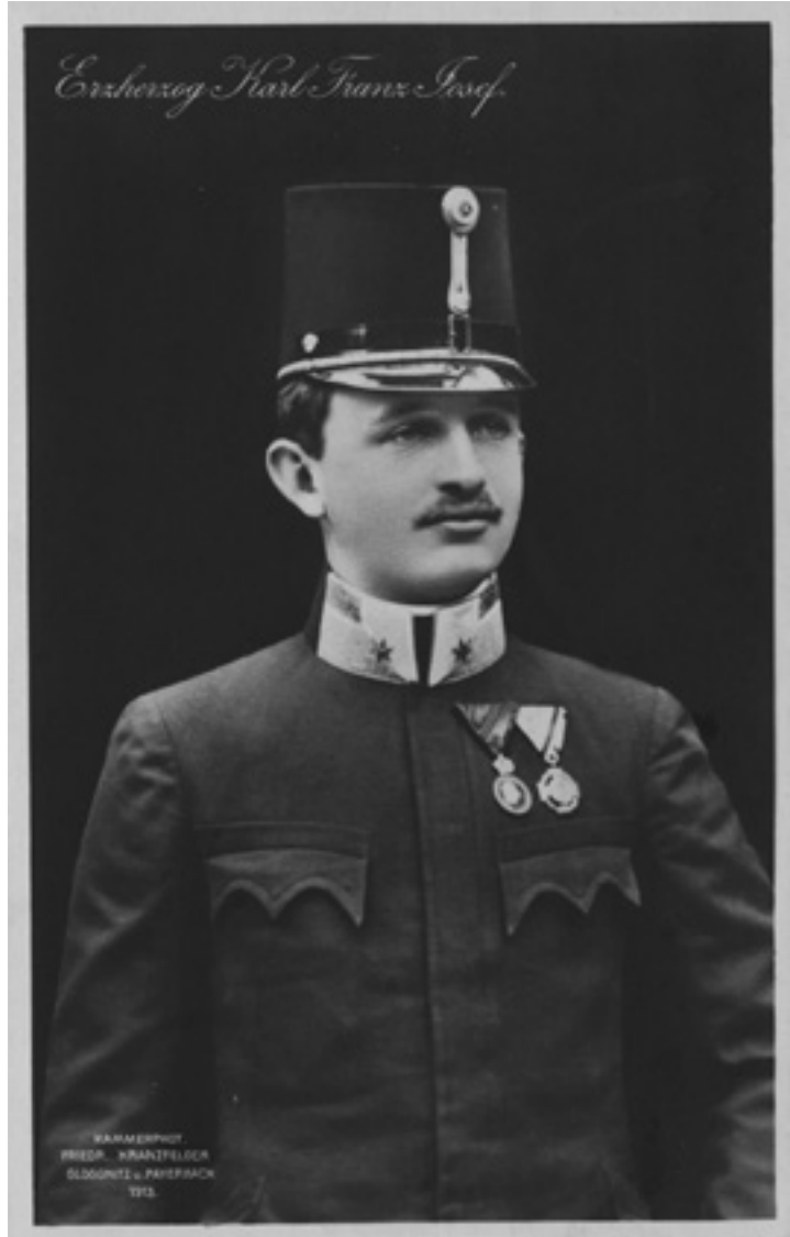
A photograph of Charles I of Austria from 1913.