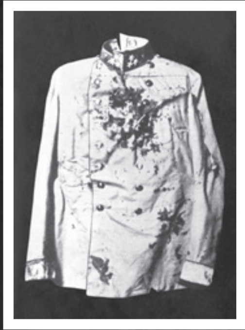
Archduke Franz Ferdinand's shirt after his assassination in 1914.