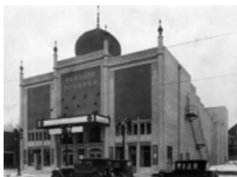
The Aladdin Theatre located at 2000 Colfax Avenue in 1927. It was one of Denver's most celebrated neighborhood theaters when it opened in 1926. The public was in awe at what they found inside. https://denverite.com/2016/09/17/denvers-lost-venues-looking-back-aladdin-orpheum-rainbow-music-hall