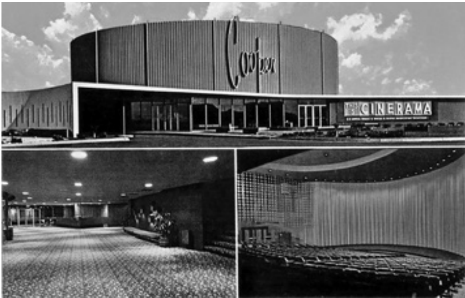
A premier Cinerama House, the spectacular Cooper gave the audience an amazing movie going experience with its immense round shape, spacious pristine lobby, contoured curved arc, etc.

It was a tragic and senseless end to what was arguably the most beautiful atmospheric theater in the Rocky Mountain region. Tragically, this historic grand landmark on East Colfax was demolished before it could be protected and saved. Perhaps the loss of the Aladdin was the impetus for future efforts to save Denver historic landmarks. A living ethereal vision of a building was lost to the wrecking ball. It could have undergone restoration. The treasured gem of a theater beloved by Denverites in general and moviegoers in particular could have been saved. Instead of being callously destroyed, it should have been preserved to be appreciated, enjoyed, and used by generations to come.