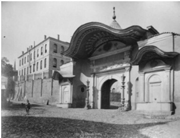
An early photograph of the Sublime Porte, the Ottoman Empire’s center of government.

For both Austria-Hungary and the Ottoman Empire, the years preceding the First World War were tumultuous for a variety of reasons. Both countries had grown closer as they went into decline. From the mid -19th century up until the end of the First World War, the Ottoman Empire was being undermined by various revolutions within its borders as well as from the encroachments of France, Great Britain, and Russia. Similarly, the Austrian Habsburg aristocracy that controlled territories in the Balkans and Central Europe was pressured by both Russia and Serbia from without and by nationalist