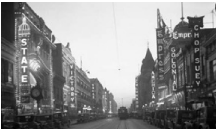
Downtown Denver Theater Row, c. 1927 - Curtis Street, known as "the best lit street in the world," at the time the city had a total of 66 theaters of various persuasions. A February 1914 issue of Denver Municipal Facts featured an article titled, "Denver Ranks Among the First as a Theater Center."

The fantasy theaters of Denver are invaluable time capsules. They are significant as an excellent illustration of a mentalité in time. They offer a unique reflection of social and cultural phenomena that prevailed in the Mile High capital city of Colorado. The Mayan and the Paramount are architectural treasures that were saved; the Aladdin and the Cooper were architectural treasures that were lost to the wrecking ball. In 1926, 1930, and 1961 these four beautiful theaters opened to the amazement of audiences. Through time and place these variegated movie houses have brought the world-at-large to their audiences edifying and entertaining them. These theaters are known for the splendor of their fantastic architecture that enclosed people for special times and moments of enjoyment.