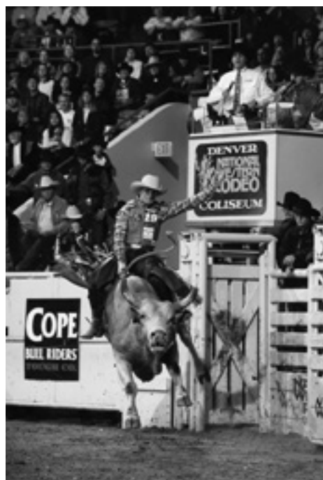
Professional rodeos are a fan favorite at the National Western Stock Show.