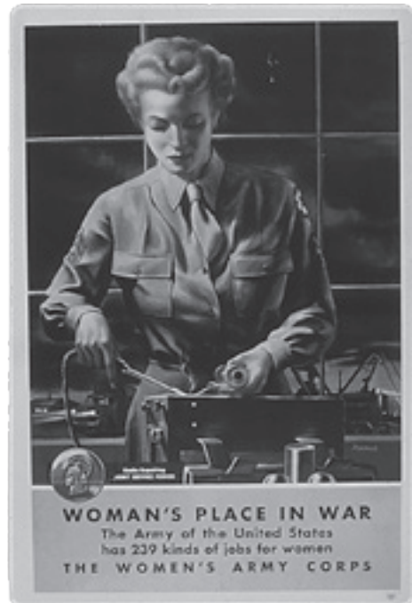
"Woman's Place in War Radio Repairing," WAC Recruitment Poster

Within a few months the program underwent a major change. On July 1, 1943, the US Army incorporated the WAACs as the "Women's Army Corps" (WACs). Members received the same ranks and grades as the regular army and enjoyed similar benefits, such as "Government insurance, allotments, and free mailing privileges." 24