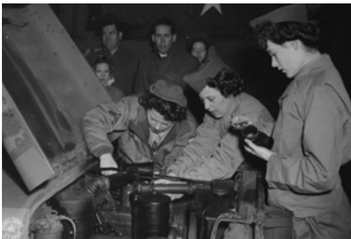
WACs Working on Truck Engine.