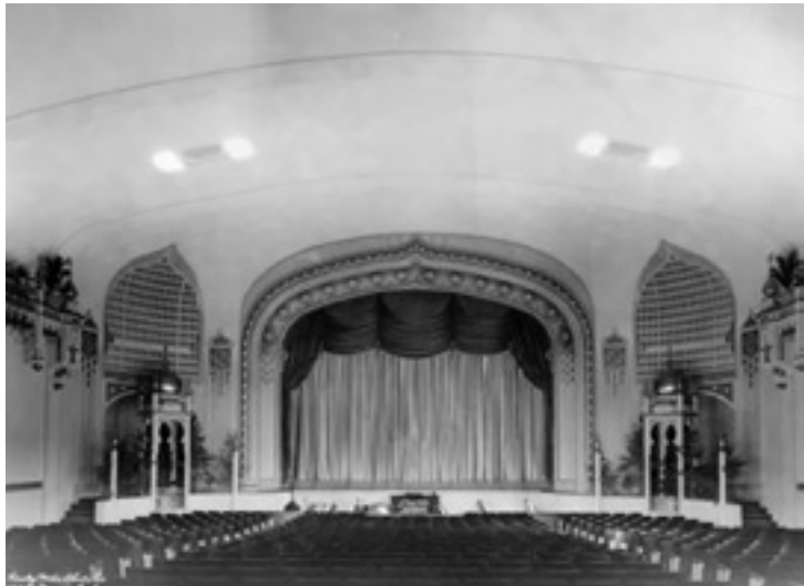
The Aladdin Theatre combined exotic eclectic Mughal style with Moorish revival style in movie house architecture. A fantastical architectural gem, it was where the Arabian Nights met the Rockies.