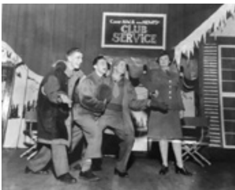
Camp Hale's Own Musical Comedy "Hale and Hearty."

In a surprise move, the US Army paid the WACs on the same scale as the men of equal ranks as "an integral part of the Army of the United States." 25