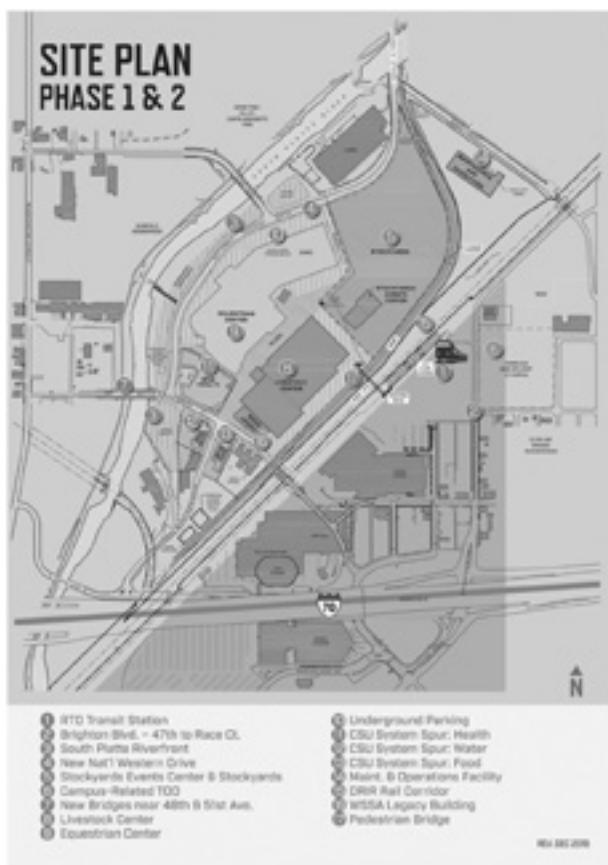
Layout of the future National Western Center in Denver, Colorado.

ism in Colorado. Beginning with an emphasis on education tourism, which brought tourists from as far as Australia, the National Western Stock Show has widened its audience appeal by offering diverse means of entertainment. Ranging from trade shows and dancing horses, to Mexican rodeo extravaganzas and the Superbowl of livestock shows, the National Western Stock Show has successfully framed itself as a tourist attraction accessible to all. Whether a person is a professional cattleman from the plains of Colorado or a city person from a Denver suburb, anyone can come to the National Western Stock Show to enjoy what the western way of life has to offer. Through the successful implementation of program development, calculated physical expansion, influential images, and rhetoric, the Western Stock Show Association has created an event that has bolstered Colorado's heritage tourism and established itself as a premier tourist destination in Colorado every January.