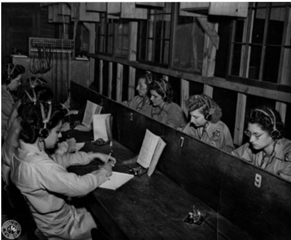
WACs Learning Code.