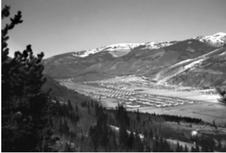
View of Camp Hale in the Pando Valley, Colorado

Colorado's winter and range of mountains put it on the short list, but several other states, such as Oregon, Washington, and Vermont, were considered as well. Ski troops initially trained at Mount Rainer, but the National Parks Service imposed too many restrictions on the camp. 2 Pando, Colorado, a remote stop on the Denver and Rio Grande Railroad about fourteen miles northwest of Leadville, was then chosen almost a year after General Marshall had authorized the creation of the ski division. The town's high elevation (9,250 feet), its location on the railroad, and its heavy snowfall made it an ideal location for the ski troops to train. 3