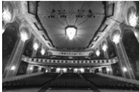
The Aladdin Theatre located at 2000 Colfax Avenue in 1927. It was one of Denver's most celebrated neighborhood theaters when it opened in 1926. The public was in awe at what they found inside. https://denverite.com/2016/09/17/denvers-lost-venues-looking-back-aladdin-orpheum-rainbow-music-hall