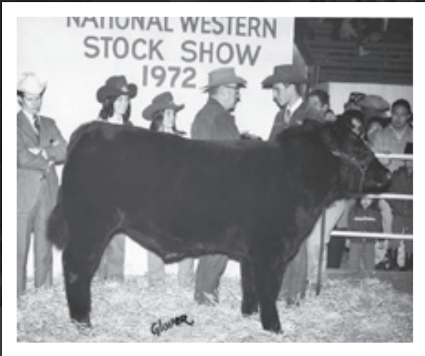
1972 Grand Champion steer, Big Mac.