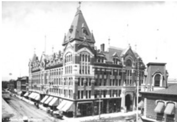
Denver's finest ever theater by far, the Tabor Grand Opera House at 16th and Curtis streets, opened in 1881 with the name of its builder, silver king Horace Austin Warner Tabor.

What, then, allowed for audiences to praise one form of female impersonation and disdain others? I argue that the theater offered a place which allowed all participants to transgress boundaries of class, race, and gender across the safety of the "fourth wall." 7 Due to the rising social status of reputable actors during the second half of the nineteenth-century, professional female impersonation came to be accepted as an artform. As long as the practice was performed within a theater, it was celebrated while earning condemnation elsewhere.