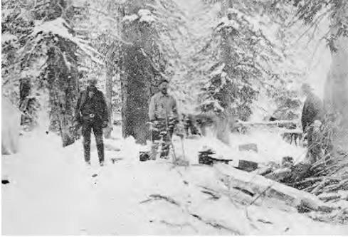
Survey camp in winter

new part of the country, and though it would be wrong to say (in the 1880s) that they were in uncharted territory, their jobs sent them to live in the wilderness for long periods of time. Of his earliest days on the railroad, another engineer noted in his memoirs that if you were unfortunate enough to burn instead of tan out on the prairies, “the wind would burn you like the sun.” 8 Hats were apparently of little help. The survey teams worked