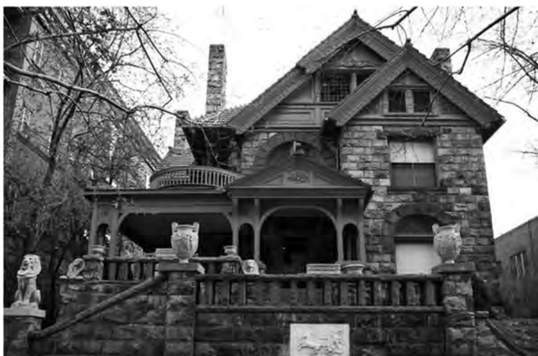
Molly Brown House, Denver