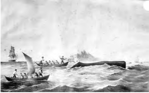
"Nantucket whalers harpooning their catch."