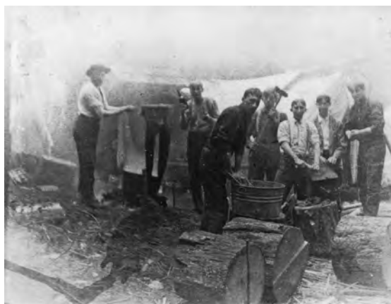
Survey crew on a Sunday