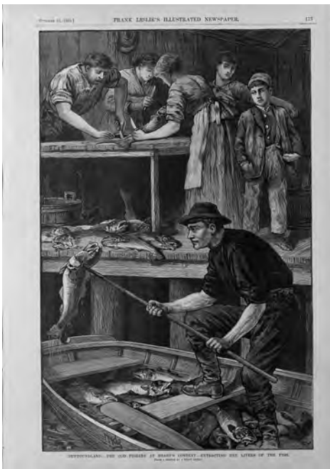
"Cod fishery at Heart's Content, Newfoundland."