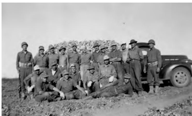
German POWs on a sugar beet farm

The relationship between German prisoners of war and the soldiers stationed at the camps was an interesting one. The official handbook given out by the U.S. Army to those stationed at the prisoner of war camp in Trinidad covered general army information, as well as the protocol for interacting with prisoners of war. According to the handbook,