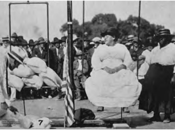
Largest woman competition, sponsored by CF&I

family contest, and a heavyweight contest, which was literally a prize for the heaviest woman in attendance. 17 Given that these competitions took place during the same time as the Suffrage Movement in America, the efforts of CF & I in sponsoring YMCA Field Days have typically been seen by ethnic studies and gender studies of the company as part of a larger company effort to reinforce older social norms in opposition to the Suffrage Movement. 18