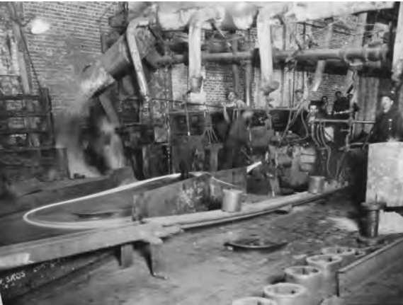
Wire Mill