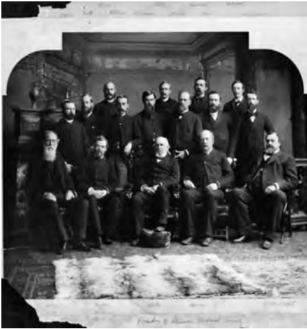
The founders of the Denver Medical Society