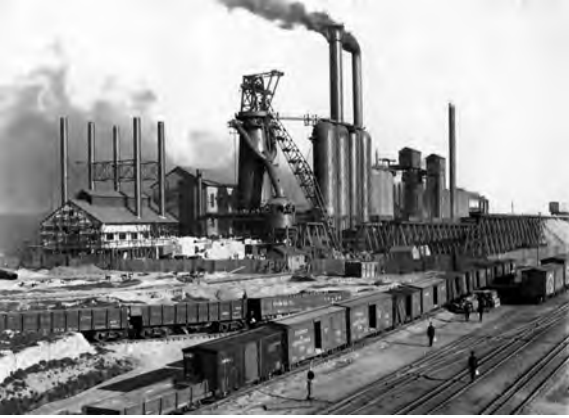
Processing at the mill