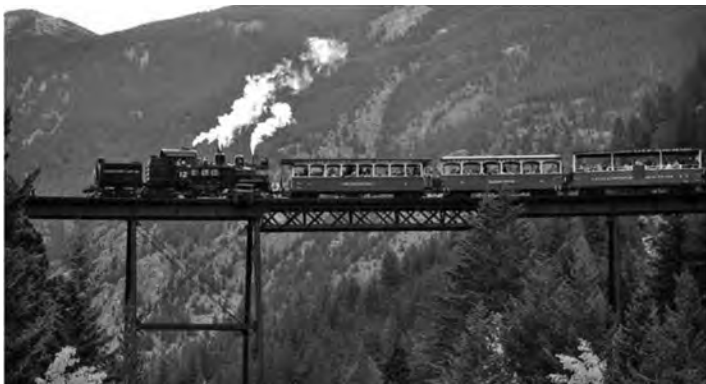
Georgetown Loop Railroad

Designated a National Historic Landmark in 1966, the Georgetown/Silver Plume Historic District is a unique setting in the Colorado Mountains. It consists of the towns of Georgetown and Silver Plume, and the Georgetown Loop Railroad that runs between them. In 1970, the residents of Georgetown created Historic Georgetown Inc, a private organization aimed at saving the historic quality of Georgetown. Very few of its structures have been lost since the creation of the organization. The history of the area as well as the number of historic properties in the town makes it one of the more special parts of Colorado, particularly for preservationists. 57