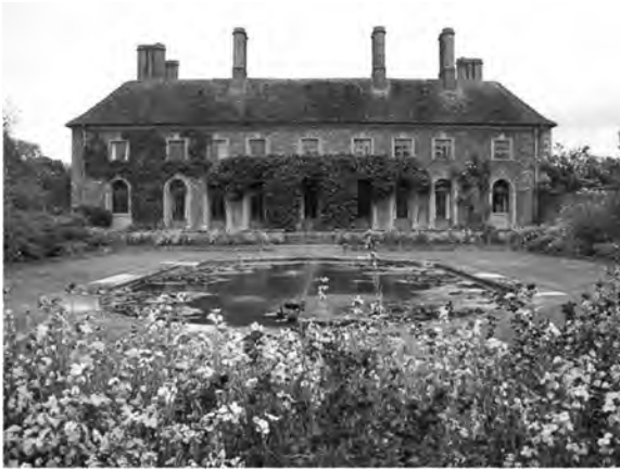
Barrington Court, England