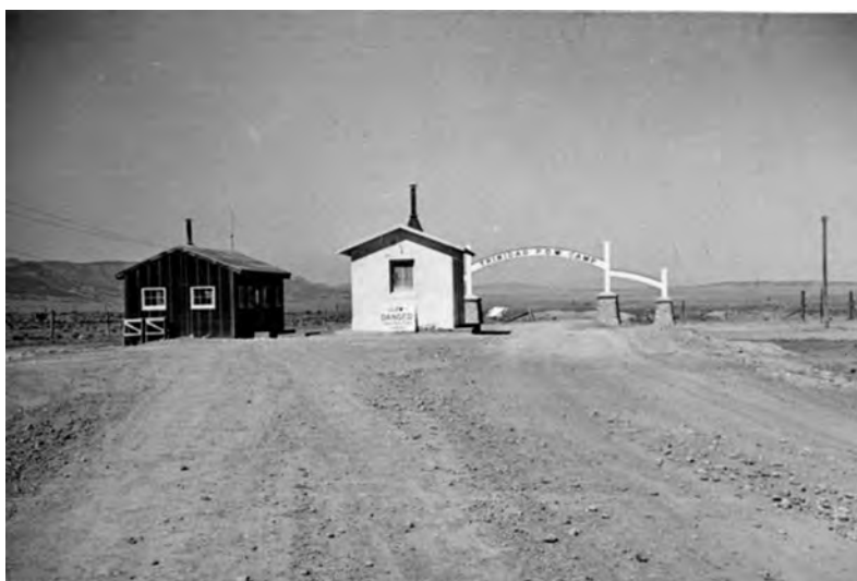
Main gate at Camp Trinidad

The majority of the captured troops in Colorado belonged to Rommel's North Africa Corps, and began arriving in 1943. The major prisoner of war camps in Colorado were Camp Greeley, Camp Carson, and Camp Trinidad. These camps also had subsidiary camps such as Camp Stonewall and Camp Hale. 7