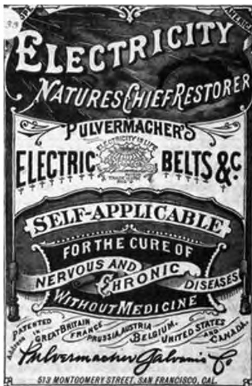
An electric belt – a typical tool used by electric physicians

In Colorado, the most abundant non-traditional physicians belonged to the homeopathic and electric schools of medicine. Homeopathic practitioners did not believe in germ theory, aseptic techniques, or many of the measures taken to protect public health. They