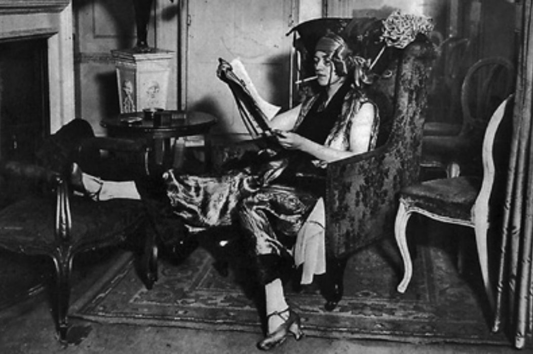
Standing Out in the Crowd. "Images of the Jazz Age."

Available from classes.berklee.edu/llanday/fall01/jazzage/crowdweb . Accessed September 5th, 2012.