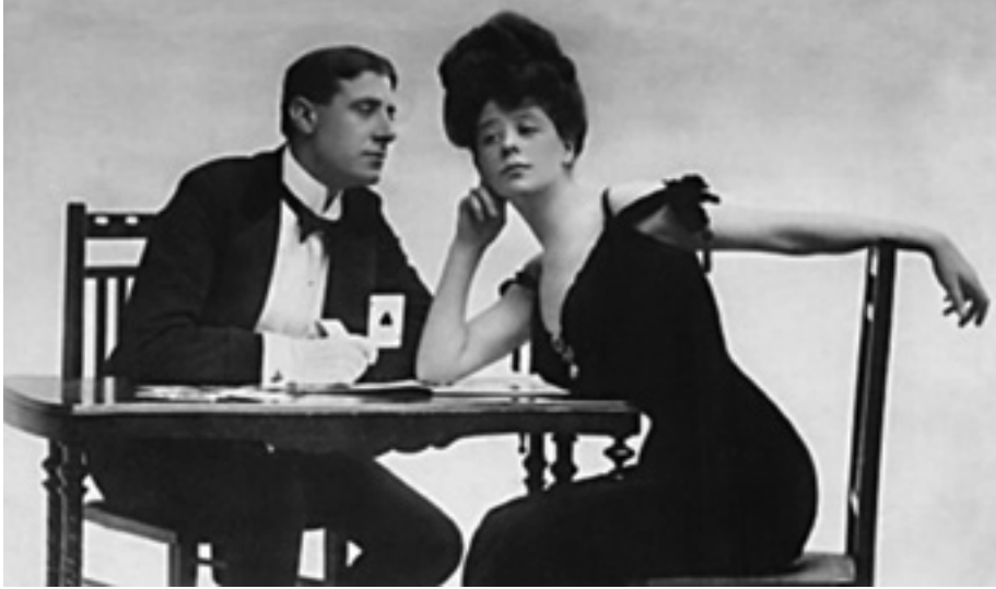
Camille Clifford and Leslie Stiles. Hulton Archive, 1906. Getty Images. Available from http://www.gettyimages.com/detail/news-photo/actors-leslie-stiles-and-camille-clifford-one-of-the-gibson-news-photo/3301288 . Accessed December 11th, 2012.

unencumbered by bustles of convention.” 11 The Gibson girls dealt a blow to mainstream Victorian ideals, and in so doing began re-defining femininity by defying and manipulating its accepted definitions. The flappers of the “Roaring Twenties” picked up where the Gibson girls left off.