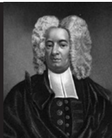
Cotton Mather, c. 1700

of both her and their deviance into a new whole. In New England, witch hunting had been a ritual for both individual and community-wide purgation. In the context of Salem, confessions were cultural texts produced by the collective effort of witches, their accusers and the authorities. To be successful, a confession had to follow certain prescriptions. 1 By contrasting the development and content of Abigail Hobbs and Mary Warren's contemporaneous confessions, this paper aims to show how confession operated as a cultural form in New England and how it ultimately failed to reunite Salem.