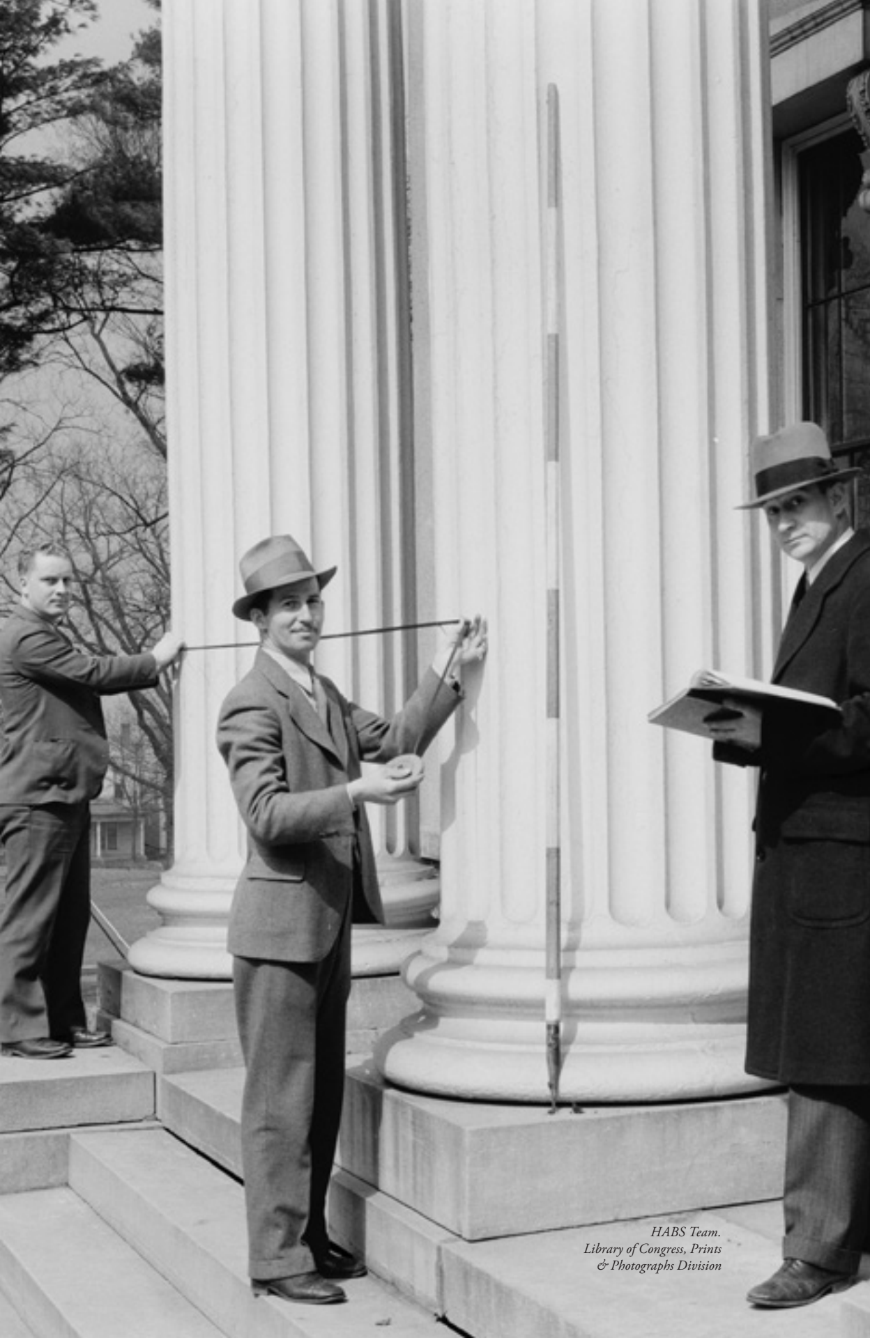
HABS Team. Library of Congress, Prints & Photographs Division