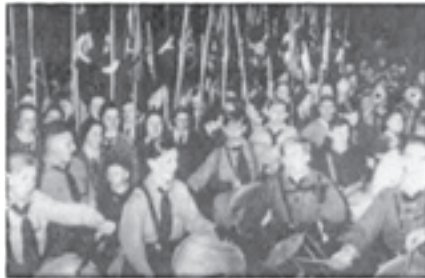
Young boys beating drums in a wild frenzy while at a NAZI function.

The Hitler Youth serving in World War II, either on the home front or on the battlefield, were victims of the abuses of power and idealism. These young men and women fell prey to the wants and desires of a regime founded on hate and racism. Many fought a bitter war protecting the Nazi ideology and sacrificed their most prized possession: their lives. Alfons Heck said it best when he stated, "The experience of the Hitler Youth in Nazi Germany constitutes a massive case of child abuse. Out of millions of basically innocent children, Hitler and his regime succeeded in creating potential monsters. Could it happen again today? Of course it can." 79 The children of the Hitler Youth were made to believe in the ideals of the Nazi regime; in the aftermath of war they were forced to acknowledge the horrors and atrocities committed by the leaders, whom they admired and obeyed. The actions committed by these children and the ideals in which they whole-heartedly believed would haunt them throughout the de-Nazification process and for the remainder of their lives. The challenges of coming to terms with the carnage of the Nazi regime and the part played by the Hitler Youth would be a lasting struggle as the surviving youth worked to rebuild Germany after the war.