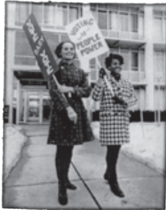
Photograph of two women in the early 1970's encouraging people to vote.

same tools as inner-city government. 73 As their challenges grow ever more complex, suburban jurisdictions need the interest and commitment of their residents. Organizations like the League of Women Voters, still seeking to engage suburbanites in civic life, must overcome a challenging climate of post-Watergate cynicism and overworked distraction among both sexes. Yet their work continues to be vital: now would be a disastrous time to let the grassroots grow wild.