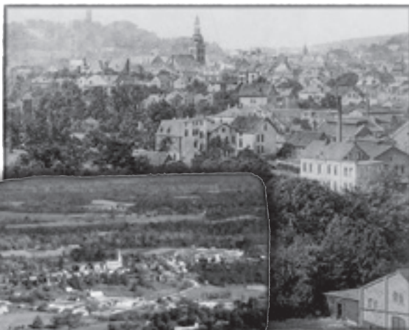
Photograph of present day Westphalia, Missouri.