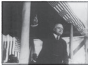
A. Mitchell Palmer on the stump. Palmer would use this platform any time he was given in order to further his criticism of the Red insurgents.

As the Great Red Scare of 1919-1920 engulfed America in a state of national frenzy, it served as both a stimulant and a pretext for Palmer's campaign. In turn, the Red Scare itself was a symptom of a rampant nativism that had gripped America in the