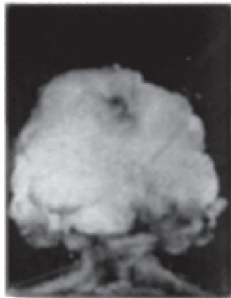
Atom bomb exploding near Bikini Island.