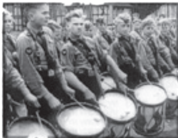
Although uniformity played an important role during their schooling it is hard not to notice the serious look and different hairstyles that these individuals sport.

Many historians convincingly argue that the education of the Hitler Youth suffered greatly during the Nazi regime because intellectual education became second to physical education. As the Nazi regime gained power and changed the structure of German society, the Hitler Youth went from being an optional organization to a mandatory duty among the youth of Germany. Hitler himself said “A violently active, dominating, brutal youth...that is what I am after. Youth must be indifferent to pain...I will have no intellectual training. Knowledge is ruin to my young men.” 16