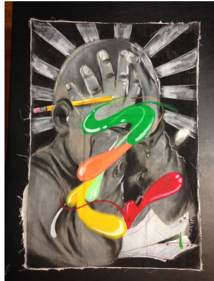
The Struggle Eric Gant Oil on pillowcase